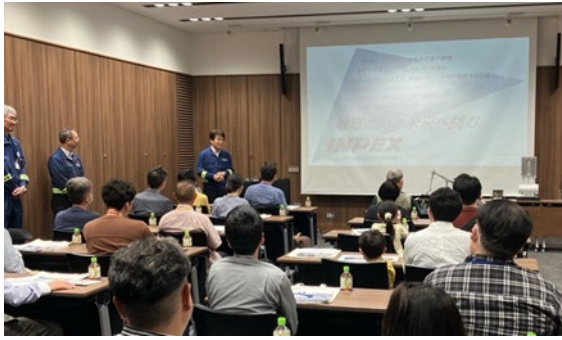
(Presentation about Naoetsu LNG Terminal)