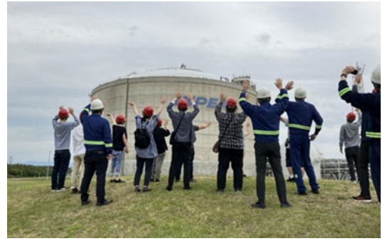
(The shareholders waving to the operators on the LNG Tank)