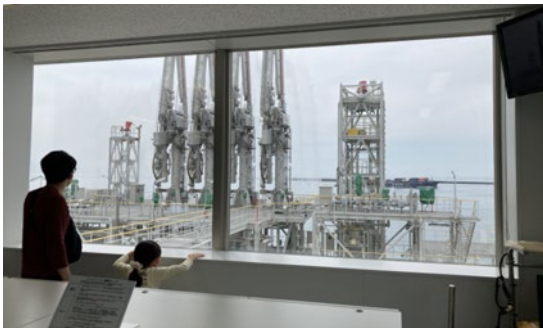
(Tour of the jetty operation building)