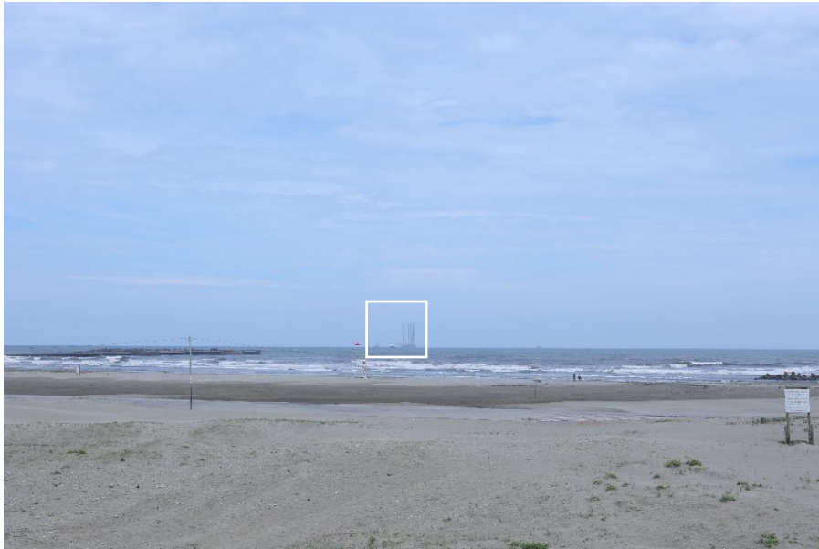
Drilling Rig Viewed from Katakai Beach (Center of Image)