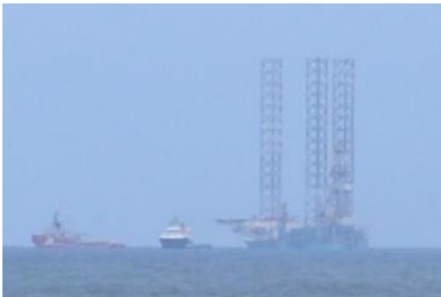
Drilling Rig Viewed from Katakai Beach (Close-Up)